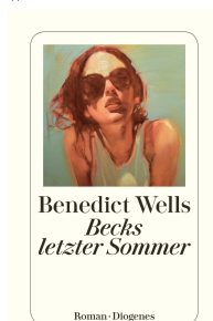
Beck's Last Summer 464 pages 2008 🏆 Award winner 🎬 Movie Adaptation