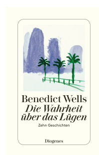
The Truth About Lying 256 pages 2018 🏆 Award winner 📈 Bestseller