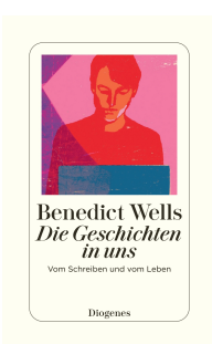
The Stories Inside Us. 416 pages 2024

Benedict Wells, born in Munich in 1984, moved to Berlin after completing school and focused on his writing, earning a living with various jobs. His fourth novel, The End of Loneliness , spent more than a year and a half on the Spiegel Bestseller list, was awarded the 2016 ›European Union Prize for Literature‹, among other awards, and has been published in 38 languages. His latest novel Hard Land was awarded the independent young adult jury's ›German Youth Literature Award‹ in 2022. After several years in Barcelona, Benedict Wells now lives in Zurich.