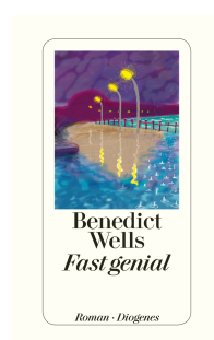
Almost Ingenious 336 pages 2011 📈 Bestseller