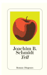
Tell 288 pages 2022 🏆 Award winner 📈 Bestseller