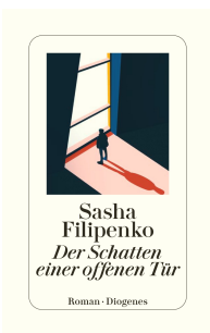
The Shadow of an Open Door 256 pages 2024 🏆 Award winner

Sasha Filipenko, born in Minsk in 1984, is a Belarusian author who writes in Russian. After leaving his training in classical music, he studied literature in St. Petersburg and worked as a journalist, scriptwriter, television presenter and gag writer for a satirical show. His novels Red Crosses and The Hunt were Spiegel bestsellers. Filipenko is an ardent football fan and lived in St. Petersburg until 2020. He had to leave Russia with his family and currently lives in Switzerland.