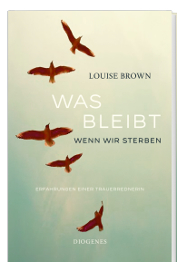
What Remains When We Die 256 pages 2021